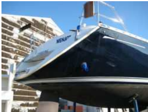
New Paint 3