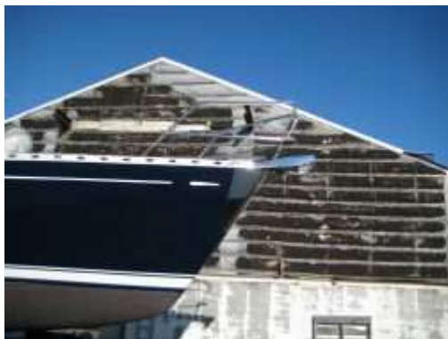
New Paint 5