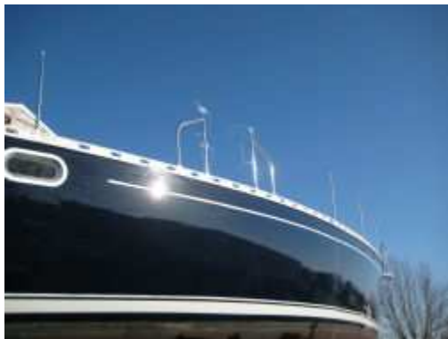
New Paint 4