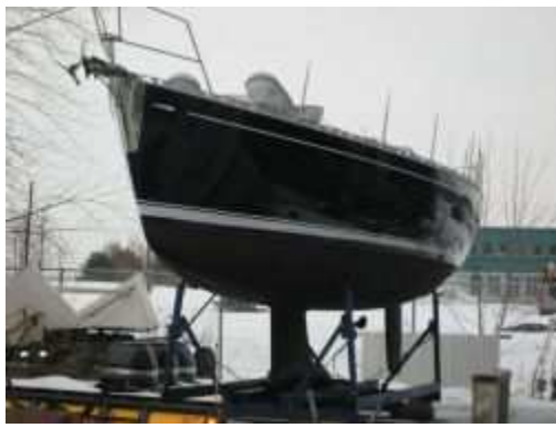
New Paint 1