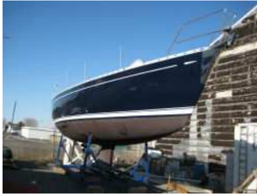
New Paint 2